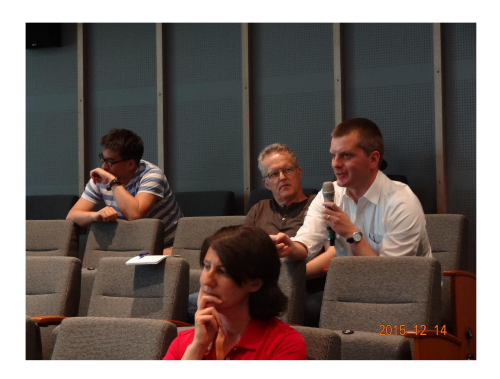
After the lecture, the audience asks the speaker questions