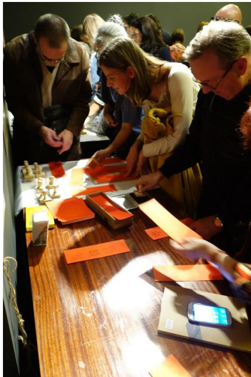
Visitors experience ancient printing techniques for themselves