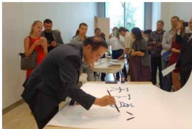
Representative Ko Kuang-yueh takes up the calligraphy brush to write the aphorism "Tian xia wei gong," and explains the meaning to guests