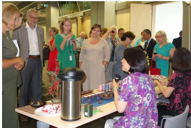
At the end of the opening ceremony, a demonstration of the art of tea drinking