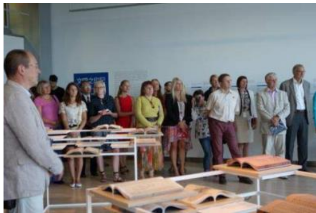
Guests gather for the "The Imprint of Civilization" exhibition opening ceremony