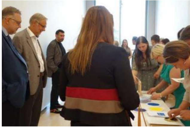
Guests attending the opening ceremony try their hand at 5-color printing