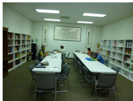
Reading area, Taiwan Academy Resource Center in Houston