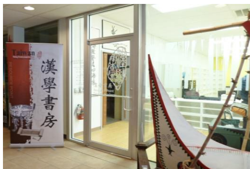
Entrance area, Taiwan Academy Resource Center in Houston