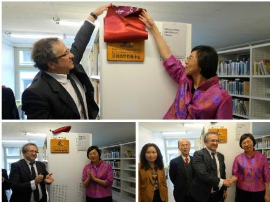
The official opening of TRCCS at Lyon III University