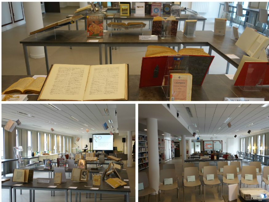
The venue for the signing ceremony

Chinese studies. Representative Lu also affirmed the value of the TRCCS established at Lyon III University, stating he believes it will greatly augment future scholarly exchange between the two countries. It also will raise visibility of Taiwan's abilities in Chinese studies.