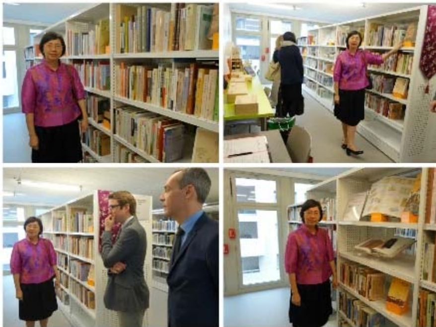
The University staffs presenting the books at the TRCCS