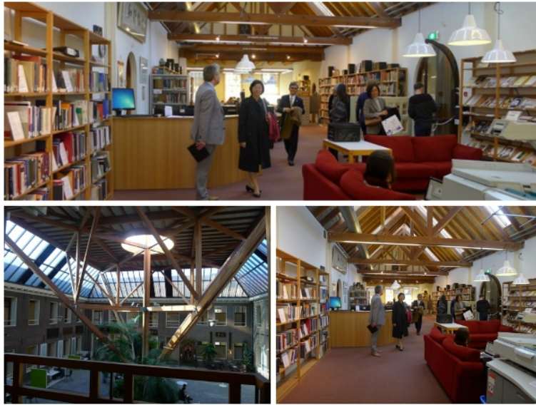
The East Asian Library of Leiden University