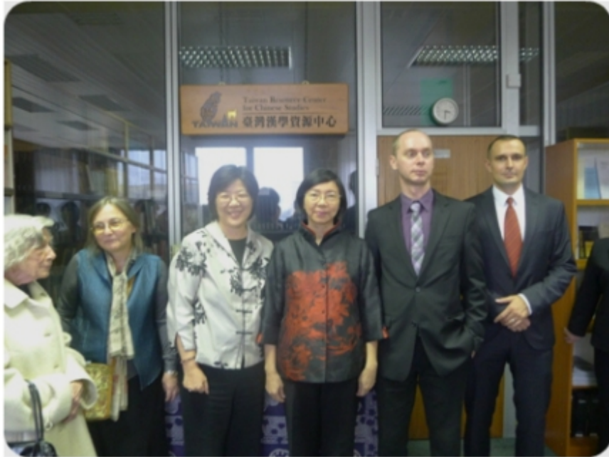
All honored guests pose for a group photo after the signing ceremony.