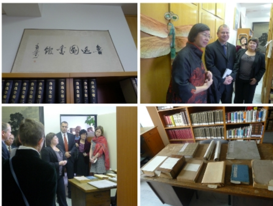
All guests are invited to take a tour of the Lu Xun Library after the ceremony.