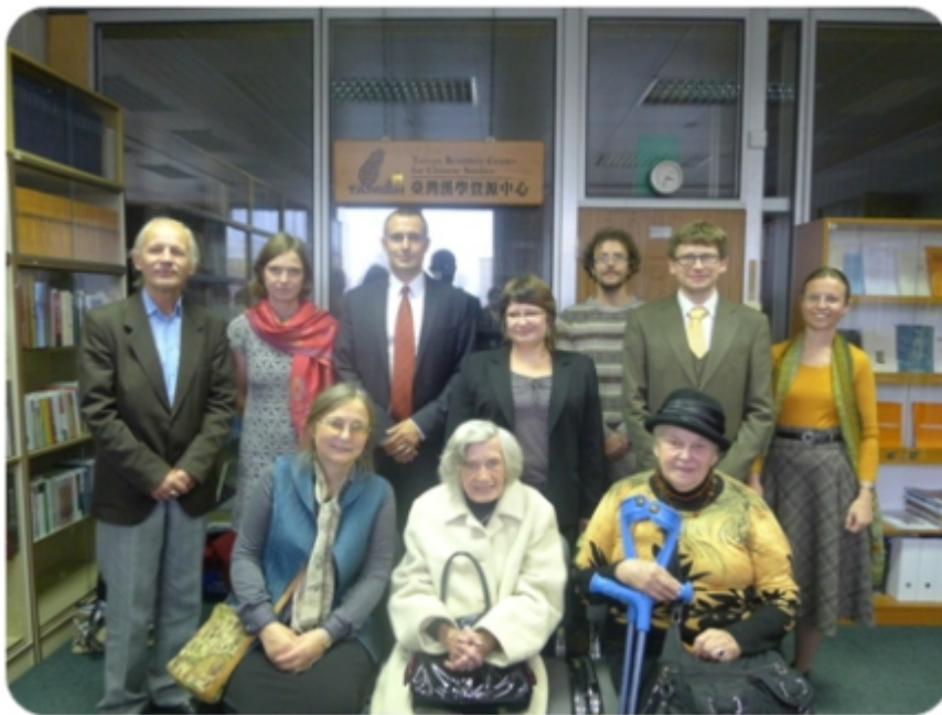
The Four generations of sinologists pose for a group photo.