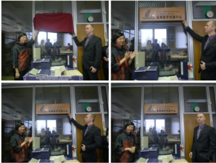
The TRCCS is unveiled at the Oriental Institute of ASCR.