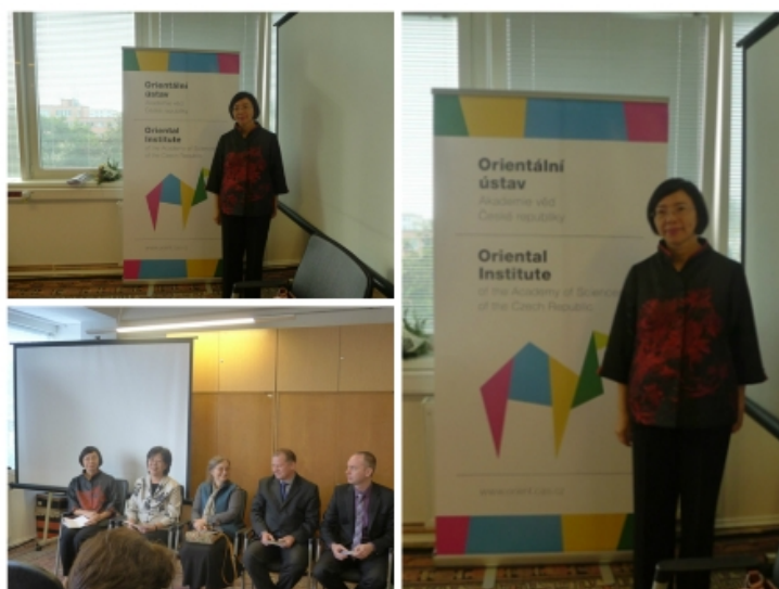
Before the ceremony